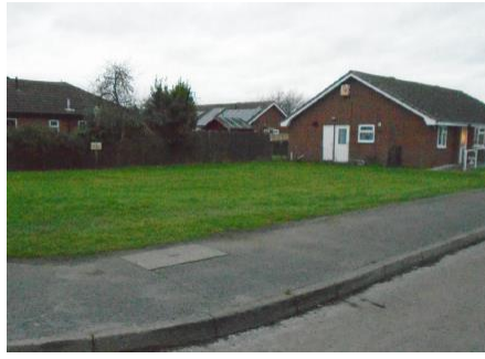
View from the proposed site to the adjacent properties