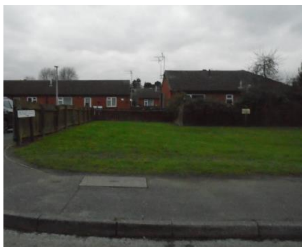
View of no.2 Healey Close (facing the proposed structure)

The level of amenity space provided to the dwelling is considered generous for the scale of the proposed bungalow for 2 people.