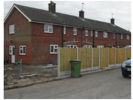
View from the proposed site to properties on the other side of Regents Close

The design of the one and a half storey dwelling is fairly simple, similar to the bungalows within the vicinity, the new dwelling would be completed with the use of Cadeby red multi bricks with Russell Grampian (Slate Grey) roof tiles which are considered acceptable as they would be similar to the materials used on Regents Close.