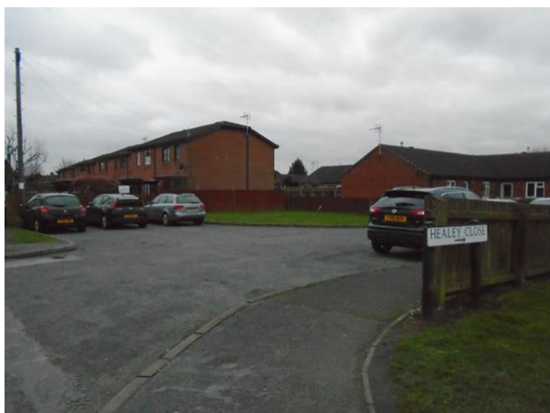
View to the communal car parking with green space

development area. The site does not lie within a conservation area, nor does it lie within the flood zone.