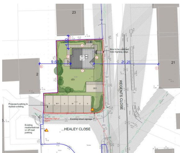
Proposed site layout

acceptable to meet the needs of privacy and that this is sufficient to avoid adverse impacts such as overshadowing and overbearing impacts.