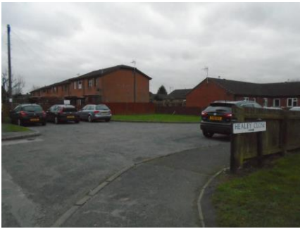
View from the proposed site to Regents Close and Healey Close