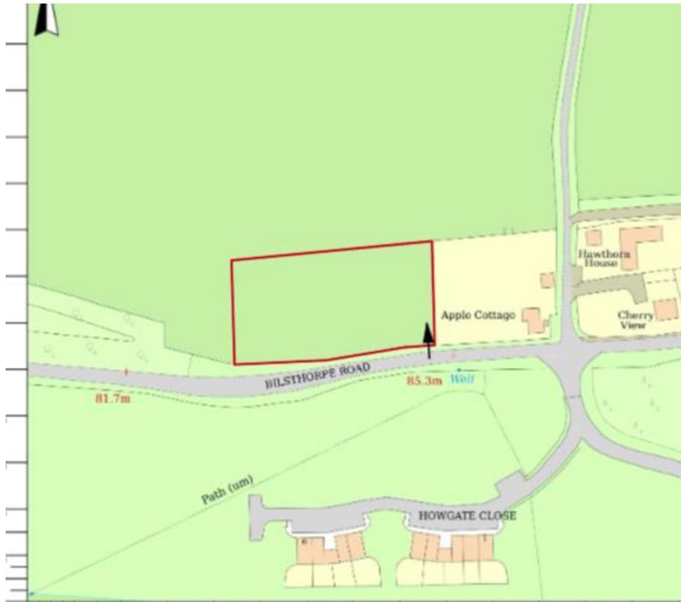
Figure 1 - Red Line boundary of site