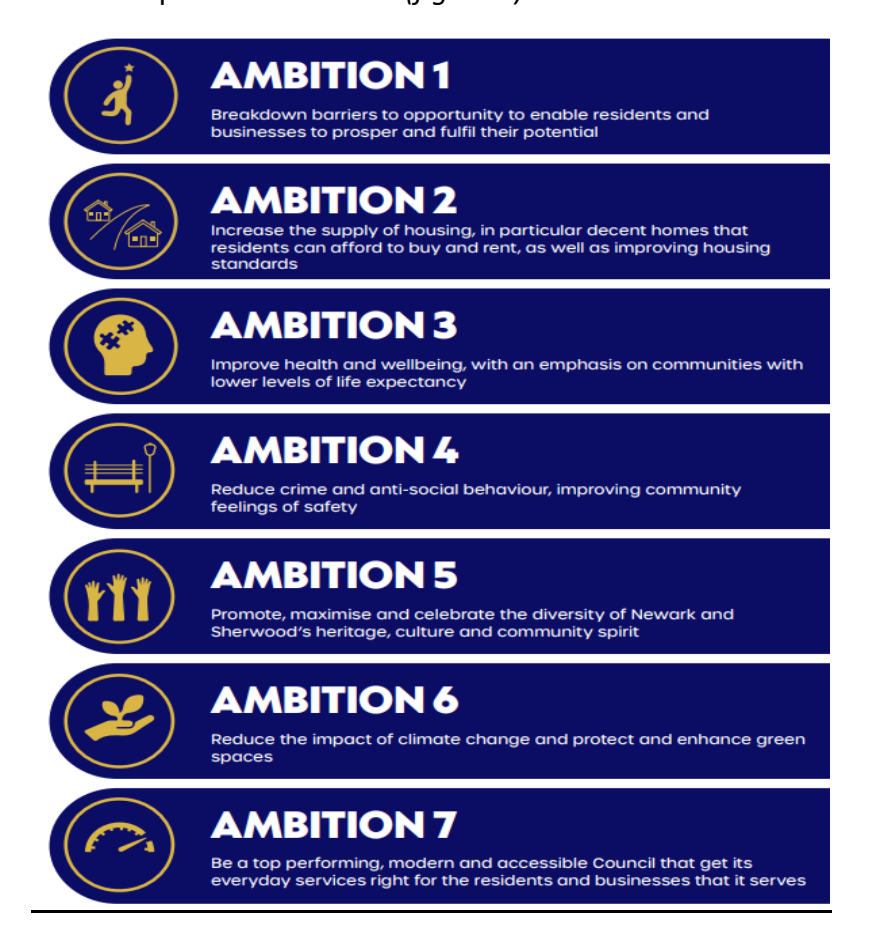
Figure 1. Community Plan Ambitions