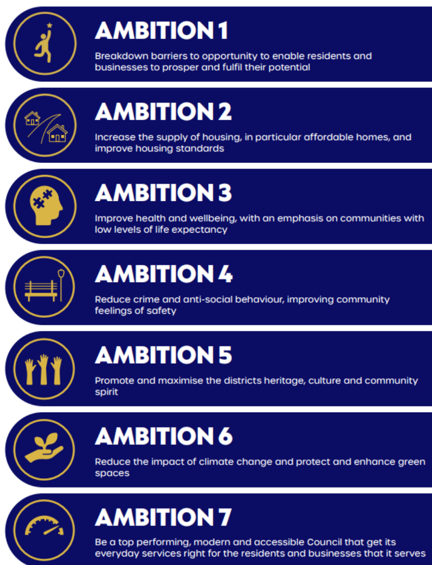
Figure 2. Community Plan Ambitions