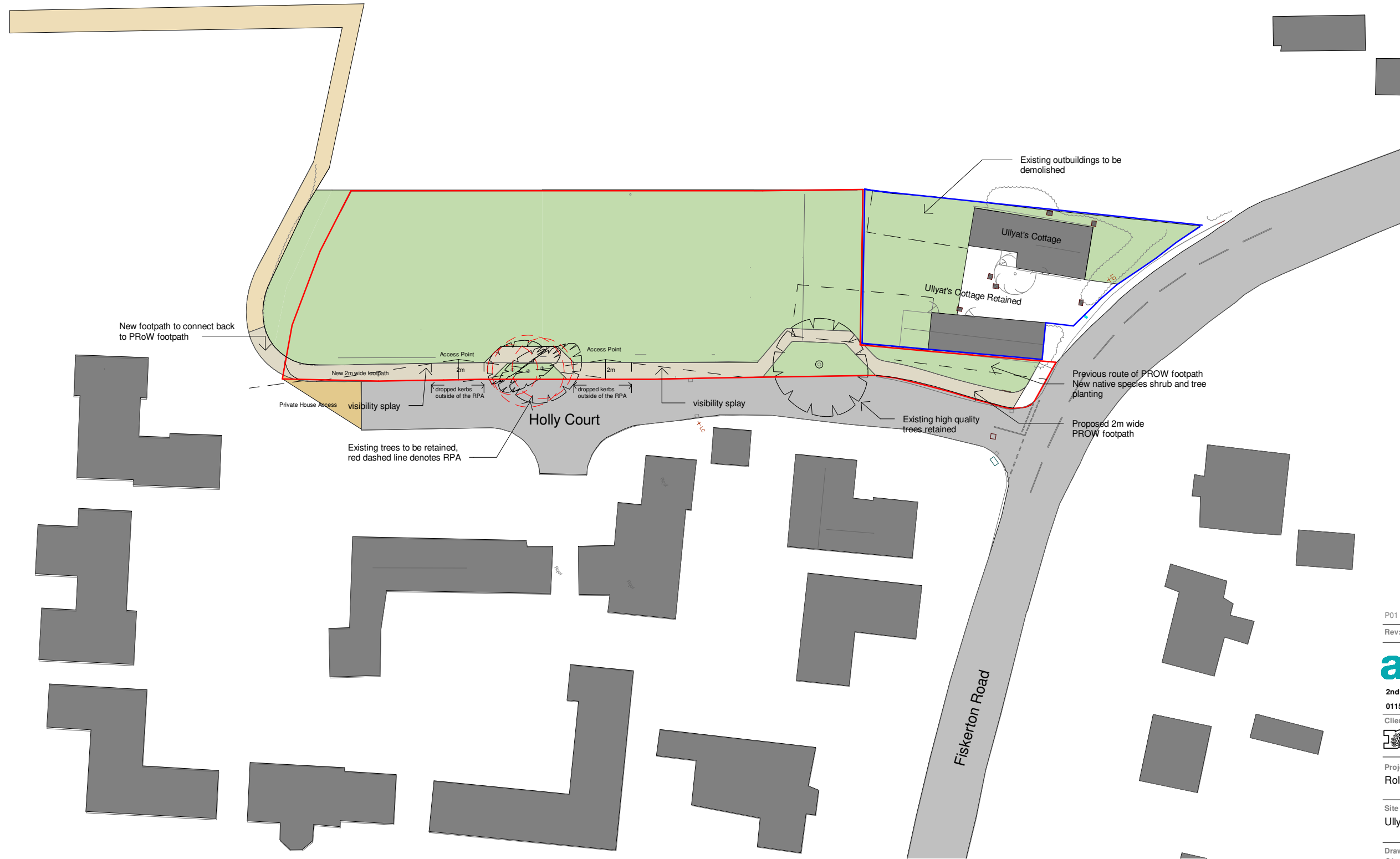
Site Plan 1 : 500

NOTE: All landscaping and ecological proposals are shown on a separate plan.