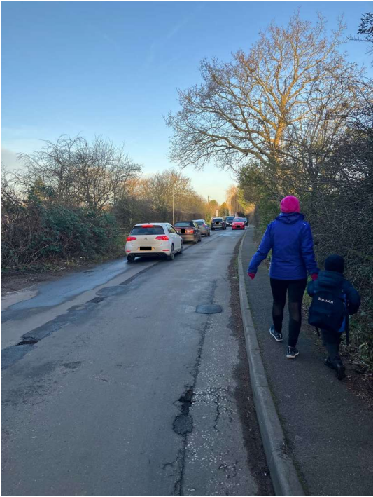
Volume of traffic on approach to site of proposed development