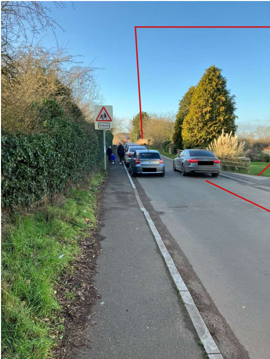
Cars parked legally and illegally on bridge