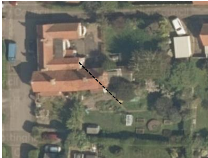
Aerial Image of Site showing 45-degree Line from Wheats Cottage bisecting Sunray

proposed extension, it is important to note that the current arrangement of Sunray with Wheats Cottage (which has been extended to the rear along the southern side) means that Wheats Cottage and likely most of the patio/garden area adjacent to the house is already affected by the main body of Sunray. Given Sunray is to the south of Wheats Cottage and its two-storey form already bisects the 45-degree line taken from the centre of the nearest ground floor principal window (see annotated aerial photo below) this property is already overshadowed by Sunray for the latter portion of the day.