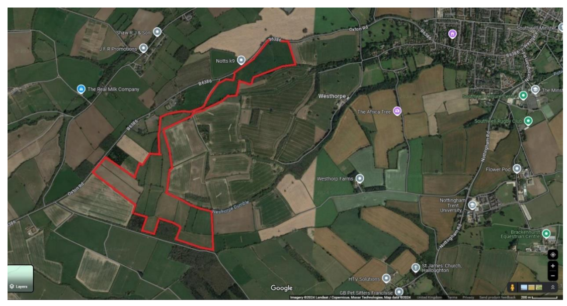
Figure 2 Approximate boundary of Thorney Abbey Site