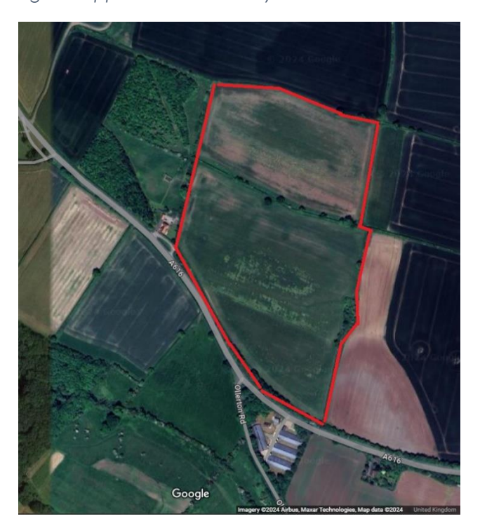
Figure 1 Approximate boundary of Little Carlton site